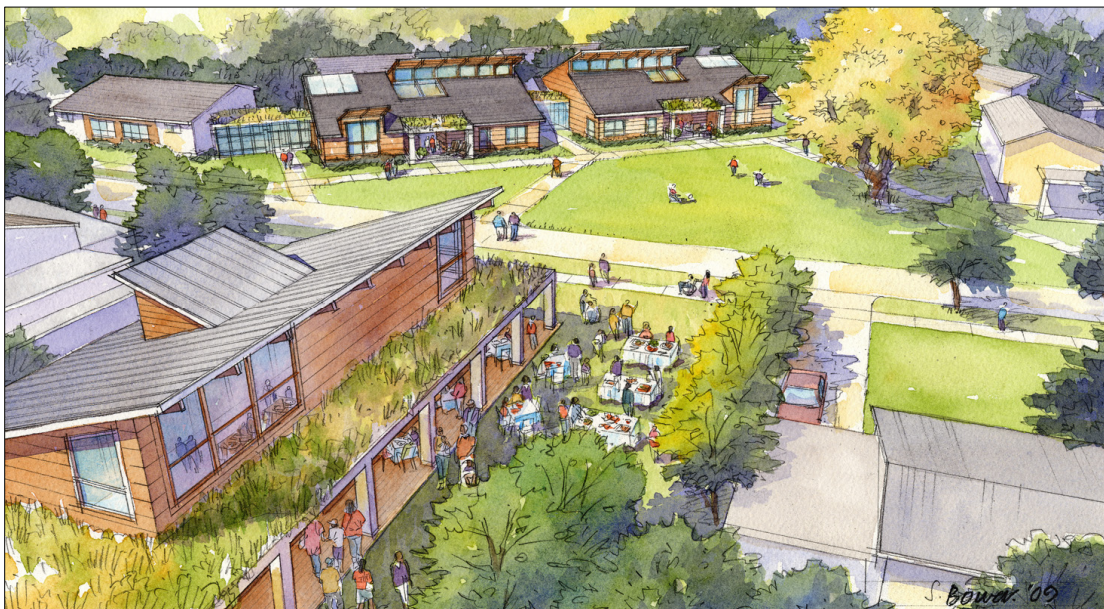
Figure 4. Aerial view of proposed new "Hope House" residences ( top center ) and new Community Center addition ( left foreground ). Mithun Architects.