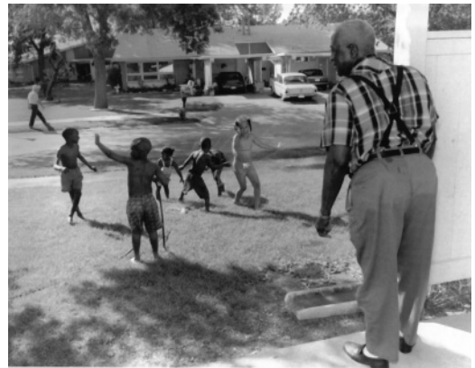
Figure 1 A Hope senior and children at play outside the Intergenerational Center (IGC) at Hope Meadows.

In 1994 the nonprofit organization Generations of Hope launched Hope Meadows – a planned, geographically contiguous, intergenerational neighborhood for adoptive families and older adults. The purpose of this neighborhood is to promote permanency, community, and supportive relationships for families adopting children from foster care while offering purposeful engagement in the daily lives of older adults. It does this in a variety of ways, but the main strategy is to facilitate and support naturally emergent alliances, relationships and lifetime commitments across generational lines. Over time, the approximately fifty seniors who live in the neighborhood become surrogate grandparents to the children, mentors to the adoptive parents, and colleagues to one another.