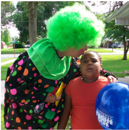
National Night Out (Left)