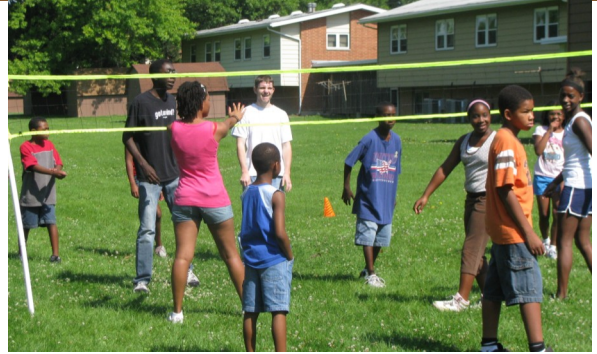
Sports Camp (above)