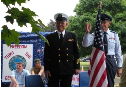
Fourth of July Parade (↑) and Picnic (↓)