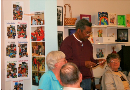
Veteran Recognition (L)